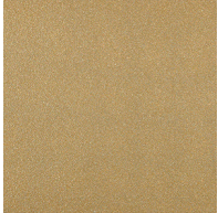
Jazz Gold - 29